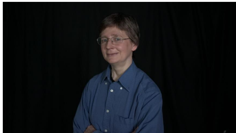
Author Photo: Kenny Leigh.